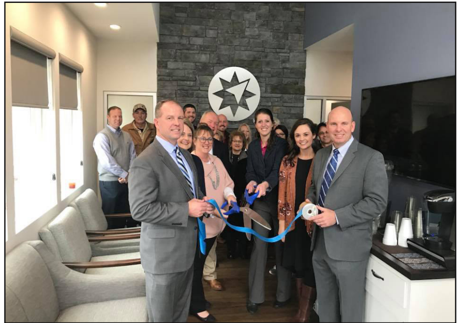
Ameriprise Financial Services, Keeton and Associates hosted a Ribbon Cutting to celebrate their new office location!