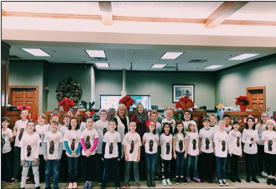
Community Bank of East Tennessee hosted their annual Networking Coffee on December 6th. SCES Students performed a few Christmas carols to set the Christmas spirit.