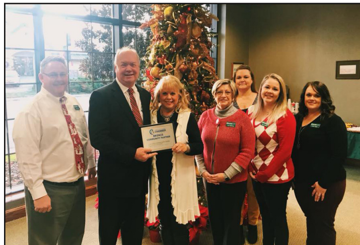
Community Bank of East Tennessee received their Community Partners plaque for their commitment to being Bronze Community Partners with the Anderson County Chamber of Commerce.