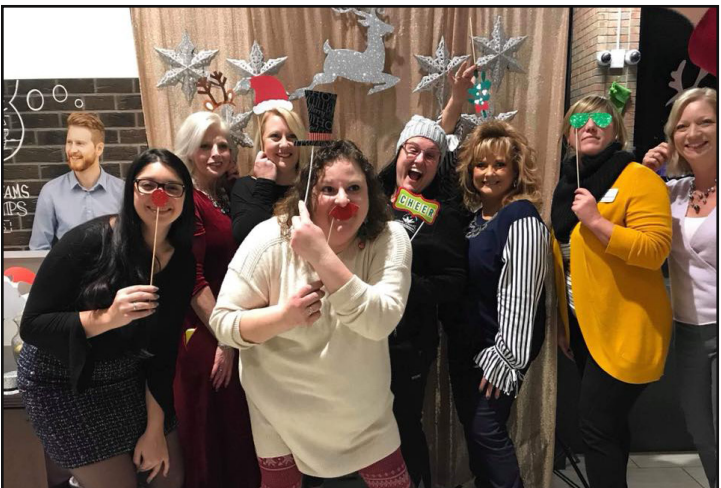
The Chamber Ambassadors pose for a photo at the photo booth.