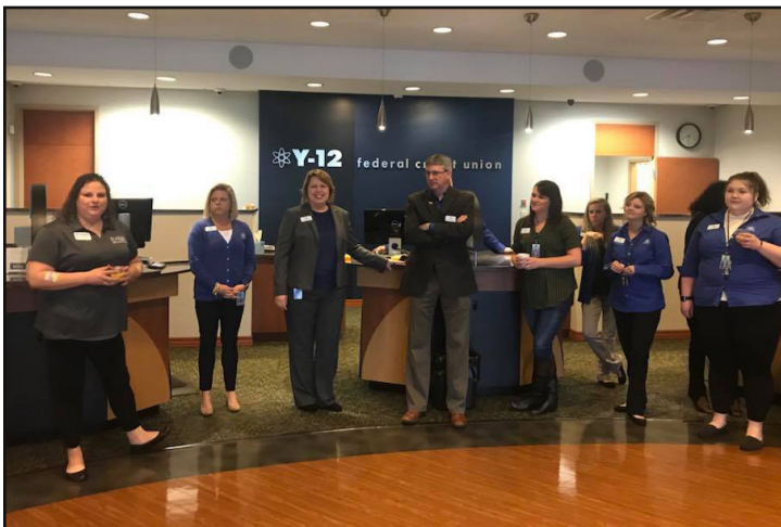
Y-12 Federal Credit Union hosted their annual fall Networking Coffee at their Clinton location by the Interstate.