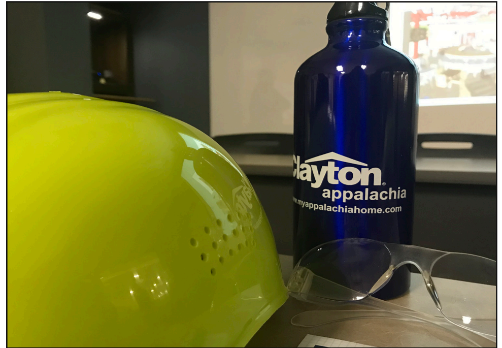
Leadership Participants toured the major manufacturing industries in Anderson County including Clayton Homes.