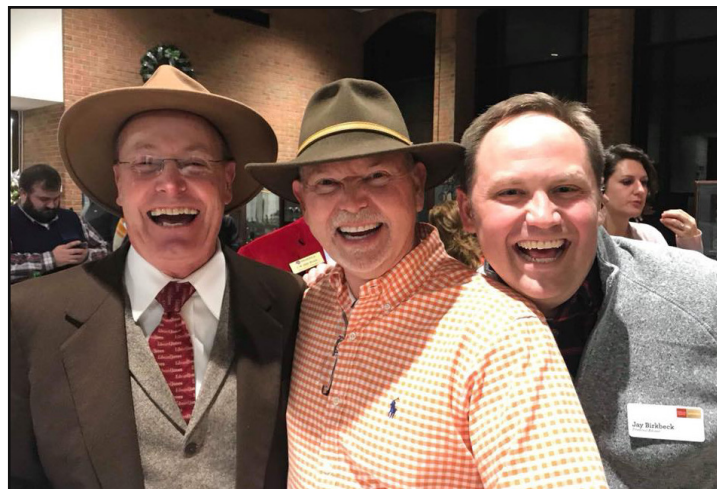
When you end up matching hats at the Christmas Open House!