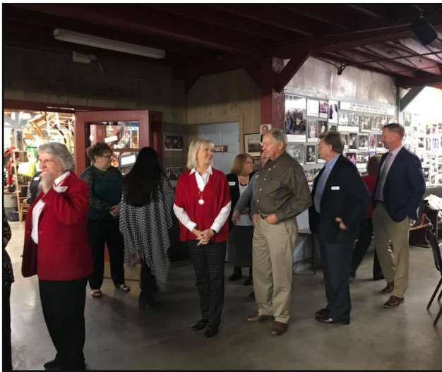
The Community Partners Appreciation Breakfast took place at the Museum of Appalachia where catering was also provided by the venue.