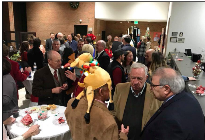
Great crowd at the 2018 Christmas Open House!