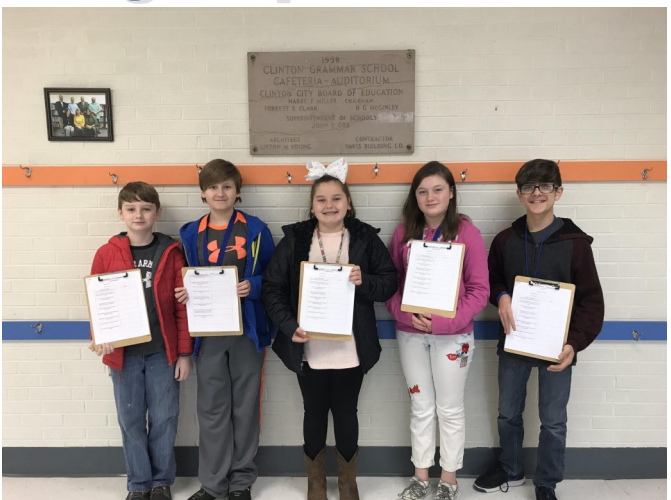
Team 2: Shining Lights