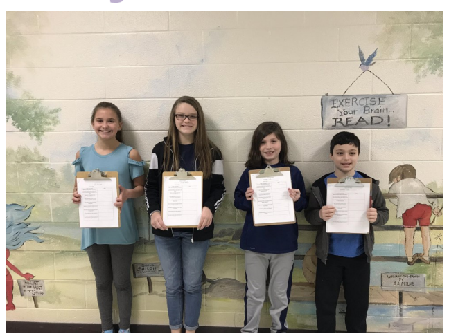
CCS Students Take on the Industries in Anderson County