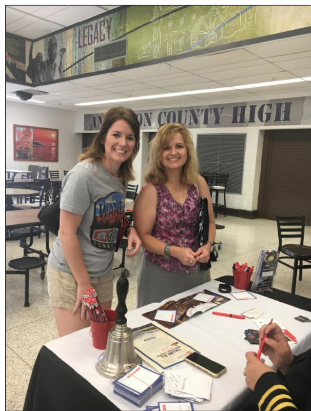
Two Clinton City School teachers sign in at the depot.