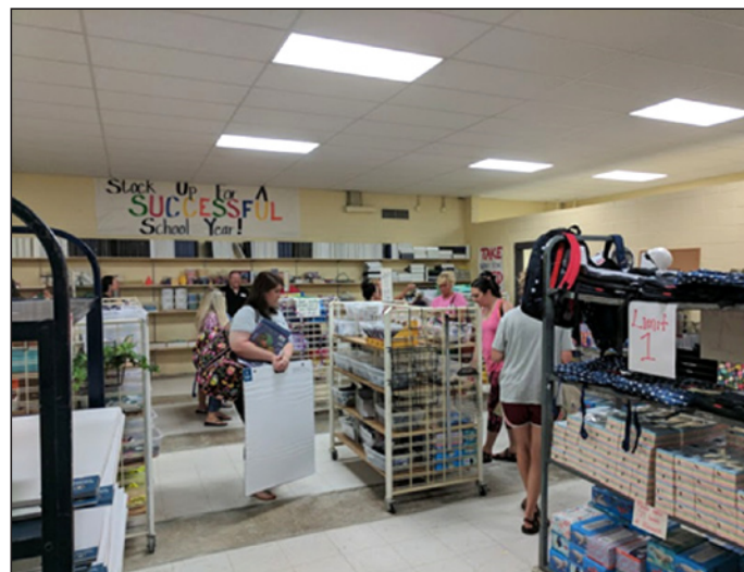
Teachers enjoyed browsing the items in the new and well stocked depot.