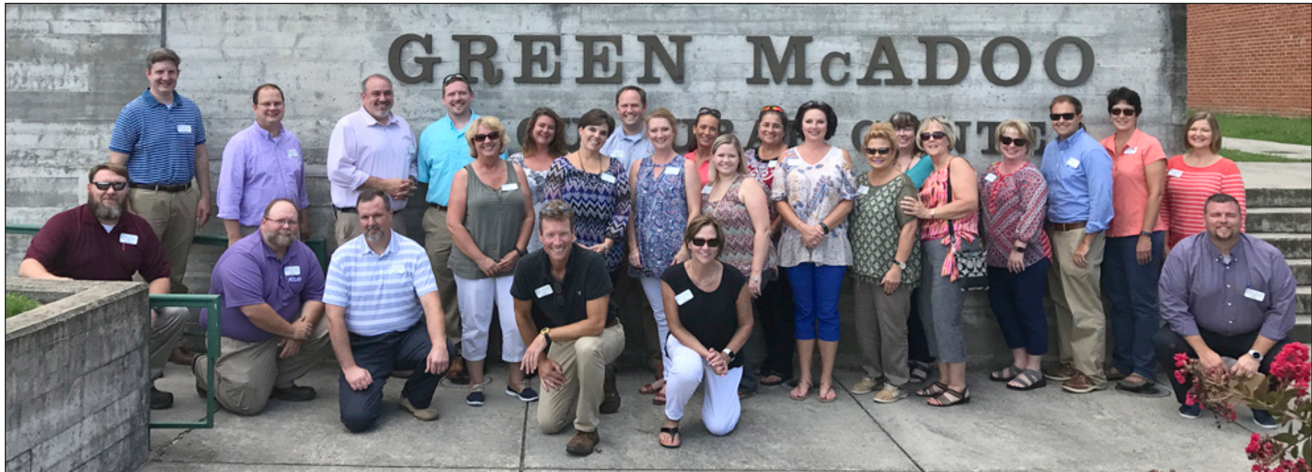
The class poses at the Green McAdoo Cultural Center.