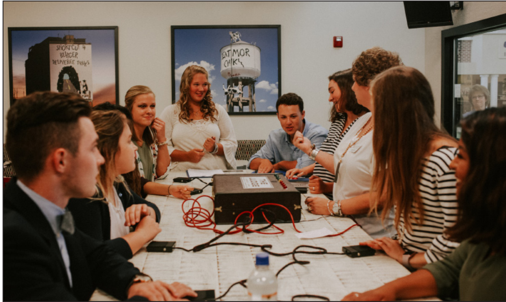
The students enjoy a game of Anderson County Trivia.

Youth Leadership Anderson County began their 2017-2018 year with orientation at Junior Achievement of East Tennessee.