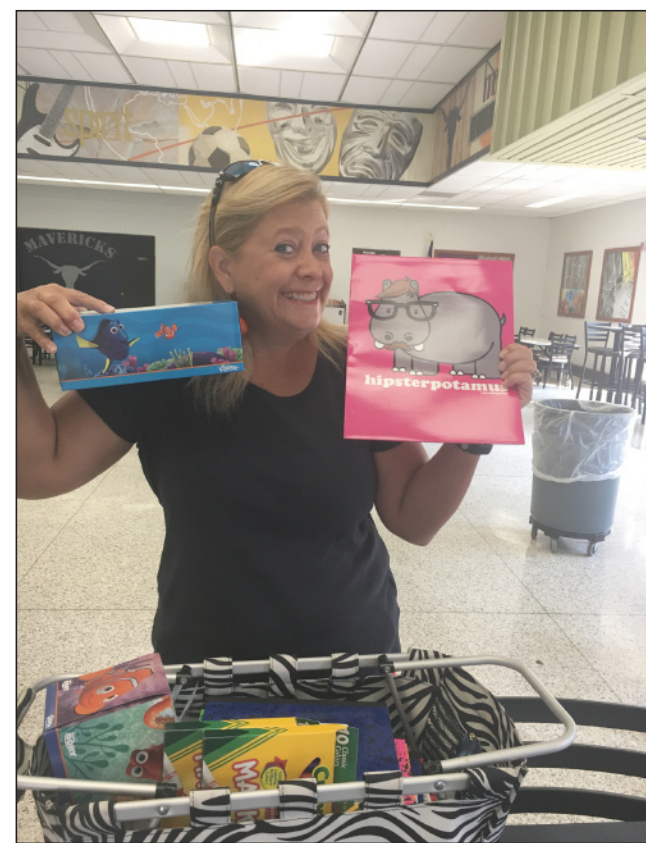
Another Clinton City Schools teacher shows off the cute things she found!