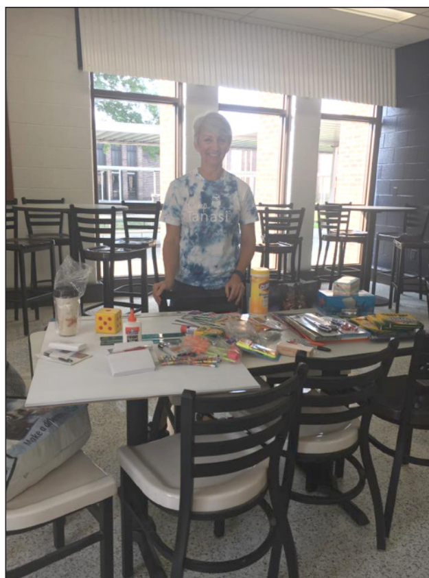
One of Clinton Elementary Schools' teachers shows off the bounty she acquired at the Teacher's Depot.