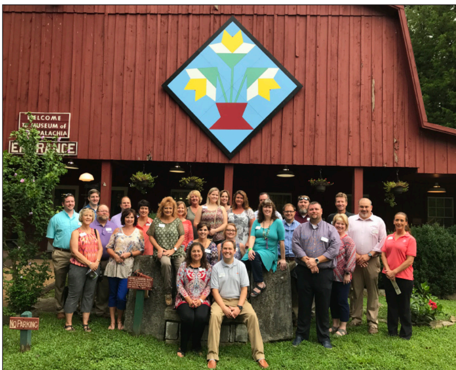
Leadership Anderson County started the morning off with a small pastry breakfast at the Museum of Appalachia and then took some time to look through the exhibits. It was a wonderful start to the Arts/Tourism Day.