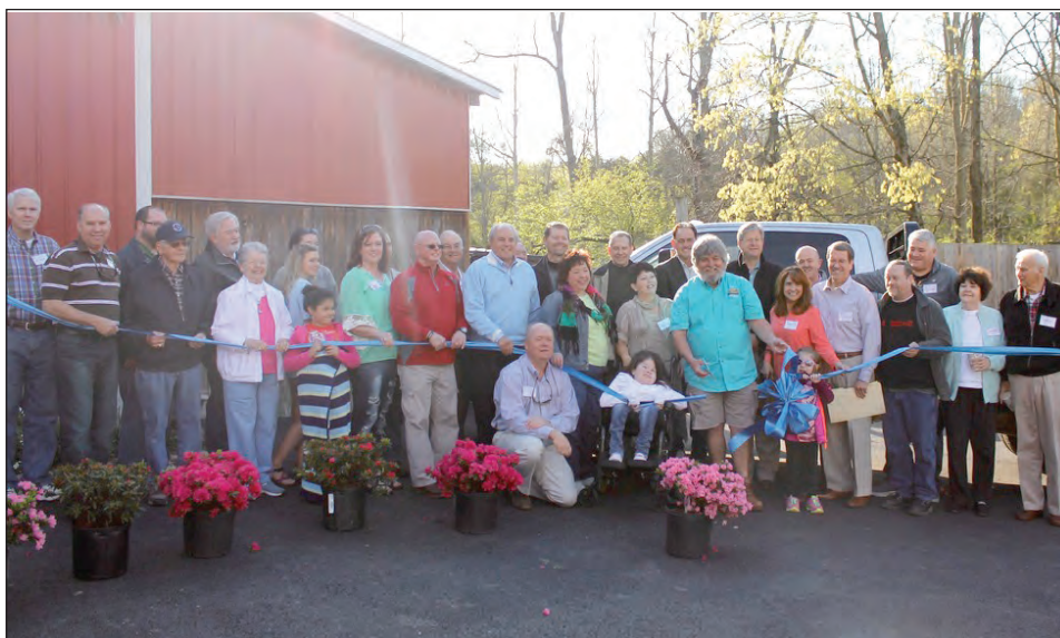
Little Ponderosa Zoo & Rescue

It was beautiful morning for a ribbon cutting at Little Ponderosa Zoo and Rescue located at 629 Granite Road in Clinton. All of the animals were ready to greet the new guests and the zoo was open for tours of the grounds. The zoo assists in rescuing many exotic animals across the US. In fact, 98 percent of their animals are rescues and have found a safe and forever home at Little Ponderosa.