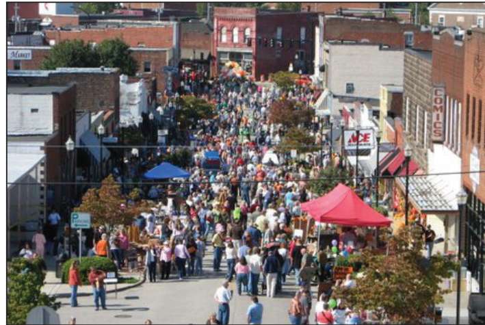
Above: Antique shoppers enjoy a beautiful day treasure hunting for unique antiques from the Festival's 90+ vendors as well as a wide array of antique shops.

For more information on the 16th Annual Clinch River Fall Antique Festival, contact the Anderson County Chamber of Commerce @ 865-457-2559 or visit: www.clinchriverfallfestival.com .