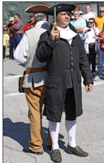
Left: Aaron Burr and Alexander Hamilton prepare to step off the historic duel prompting the Town of Burrville to change its name to the Town of Clinton. Visit the 16th Annual Clinch River Antique Festival to see a re-enactment of this famous duel.