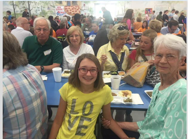
Clinton Elementary School

We had approximately 300 grandparents come and eat with us during the special lunches at each school. What a great day! Clinton City Schools appreciates all that grandparents do to make our schools so successful!