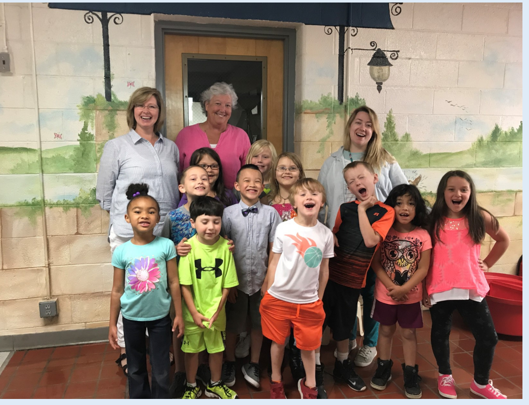
Students saying, "We love hot dogs!" on their way to eat lunch at NCES!

with the exception of July 4th week. See you there!