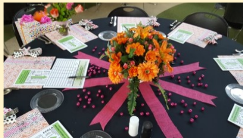
Photos of table top decorations represent the student's Program of Study, future career, and/or post-secondary plans.