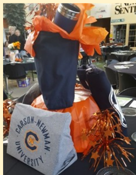
Clinton High School – Business Management and Administration and Finance