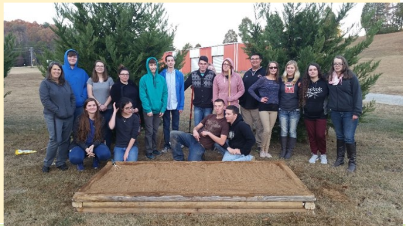
CHS Students planted 300 tulip bulbs

On Monday, November 21, CHS students from the Ag department, the Snapdragons Landscaping Club, SADD Club/ ASAP Ambassadors, and the Anderson County Health Department planted over 300 tulip bulbs on the Clinton High School campus. The SADD Club/ Ambassadors were able to get 300 students to sign a "Plant a Promise" banner the week before, promising not to use tobacco products. The clubs hope that when the tulips bloom in the spring, it will be a reminder of the promise the students made to not use tobacco.