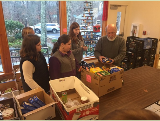
NMS students prepare baskets with community members

The students at Norris Middle School collected 808 food items for the Good Neighbors Program during a food drive