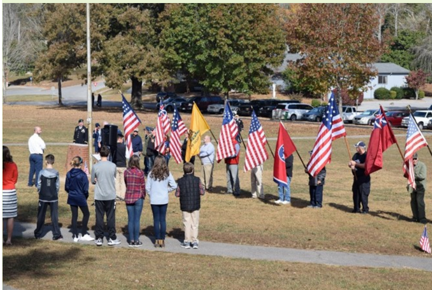
Veteran's Day celebration at Norris Middle School

Norris Middle School was proud to work with the Norris Lion's Club on Veteran's Day to honor those who have dedicated their lives to protecting our nation's freedom. Norris Middle School's