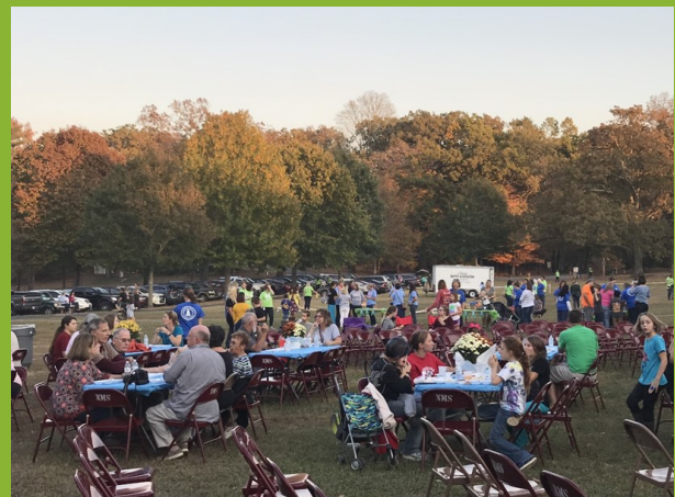
Community members enjoy an evening on the lawn at NMS

parents, and even community members with no school-age children