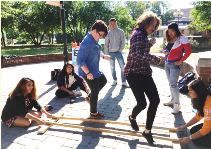
Students participate in a game native to Singapore called "Tinkling".