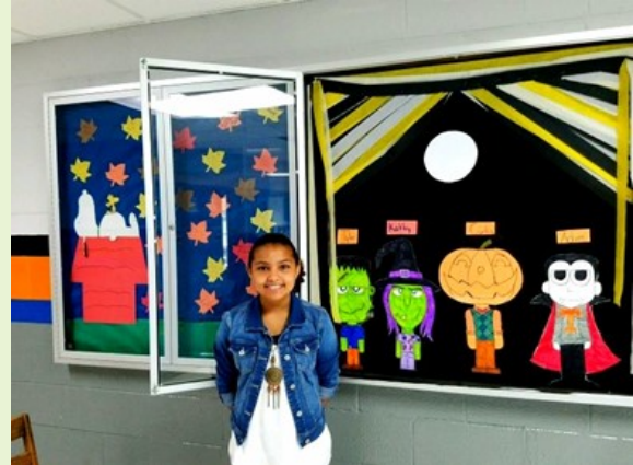
CMS Students honoring and serving their custodians!

Custodian Appreciation bulletin boards and Posters made by students were posted throughout the hallways at CMS.