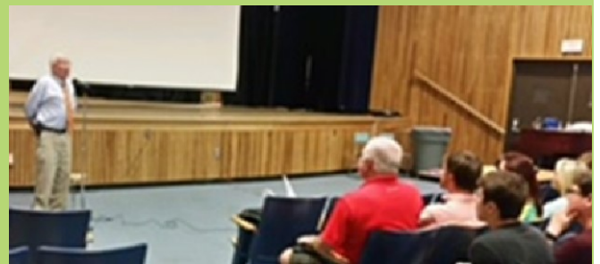
Dr. Bass speaks to a packed house!

Anderson County High School had the honor of hosting Dr. Bill Bass for his one of a kind lecture on Monday September 26. Dr. Bass, a University of Tennessee professor, forensic anthropologist, and founder of the world famous Body Farm, instructed students in anatomy, forensic anthropology, and his methodology. To the delight of students and faculty in attendance, he presented several of the cases he had worked on through the years. He showed students what he looked for in each case and how to use logic, reasoning, and scientific knowledge to solve intricate problems. This highly anticipated event sold out in less than three hours. The unique wit and humor he uses during lectures allows students to develop high reasoning skills. He provides inspiration for utilizing scientific knowledge in post-secondary education and even careers. ACHS thanks Dr. Bass for the opportunity to laugh and learn.