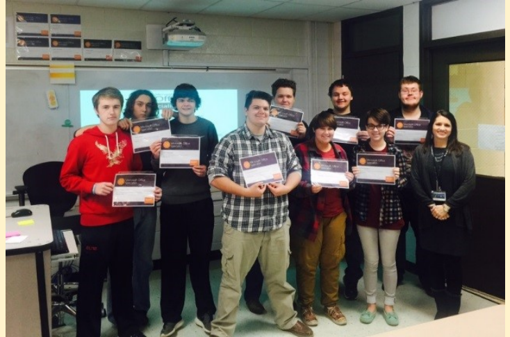
Students with their Microsoft Office Certification Certificates

and invited to Orlando in June to compete in Nationals.