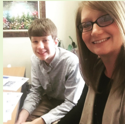
Job Shadowing at Y-12 Federal Credit Union

Overall the day was a great success! Students learned real life lessons and had a taste of just what their parents do each