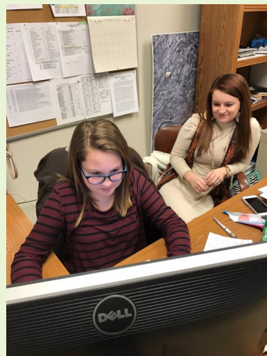
Job Shadowing at Remotec (left) and Clinton Utilities Board (Right)