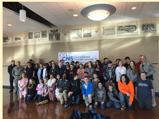
Norwood Middle School Students at CNS Y-12

The day was planned to give students a glimpse into the career they might aspire while opening the doors to business and industry partners in our local communities. Students experienced the jobs that are available, trends in industry that will affect those jobs in our local economy and