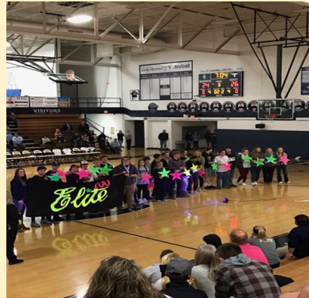
The competition is in high gear. Above is a photo of ACHS's Elite 100 being recognized during halftime of the Gibbs vs. ACHS basketball game.

Who can be the elite? YOU CAN if you believe and put your mind to it!