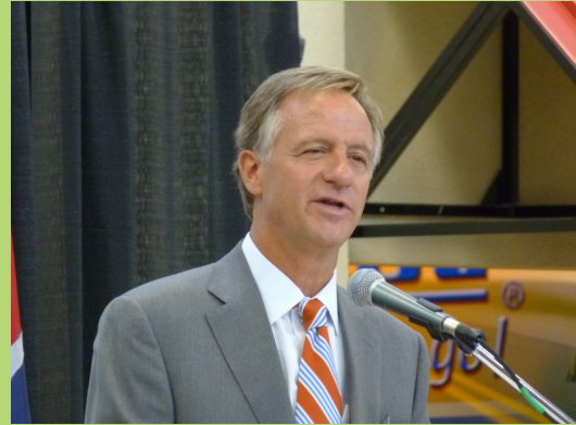
Governor Bill Haslam speaks to Anderson County Chamber Members and Educators at a luncheon in September 2016 at the Junior Achievement Building in Clinton