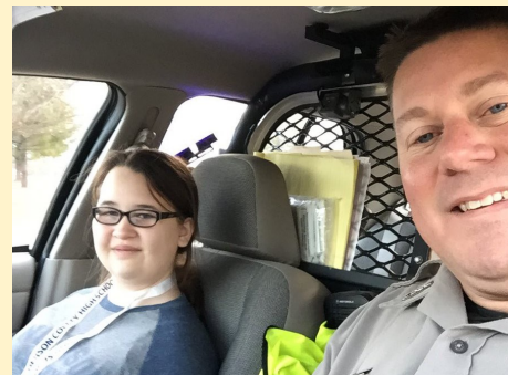
Shadowing the AC Sheriff's Department