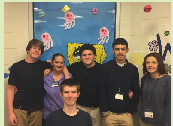
Clinch River Community School Students celebrating Utrust's "Cafeteria Staff Appreciation Day."